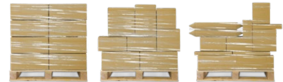
Excellent for A, B, and C loads