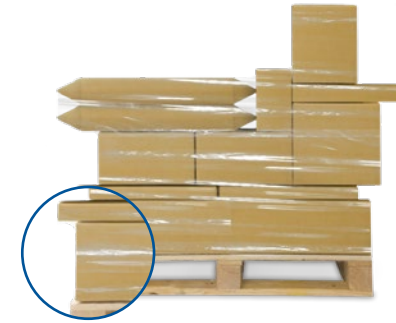
Edge of pallet without ripping